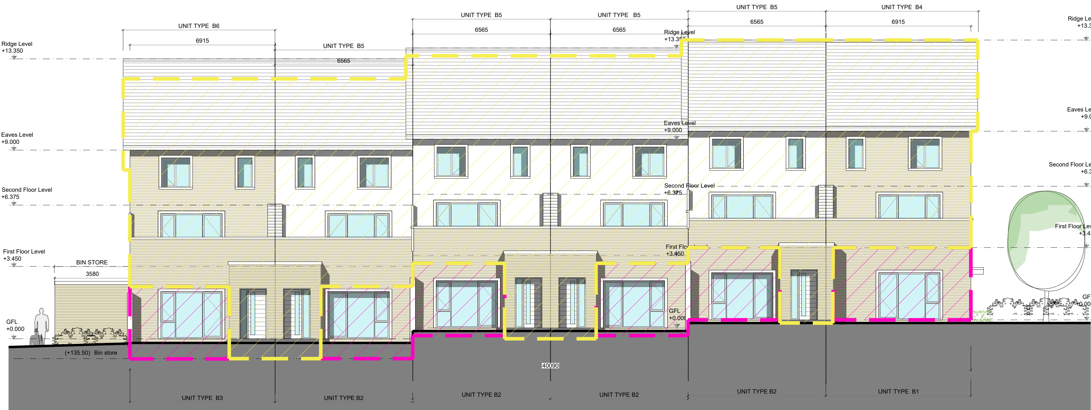
WEST ELEVATION B - BLOCK B.2